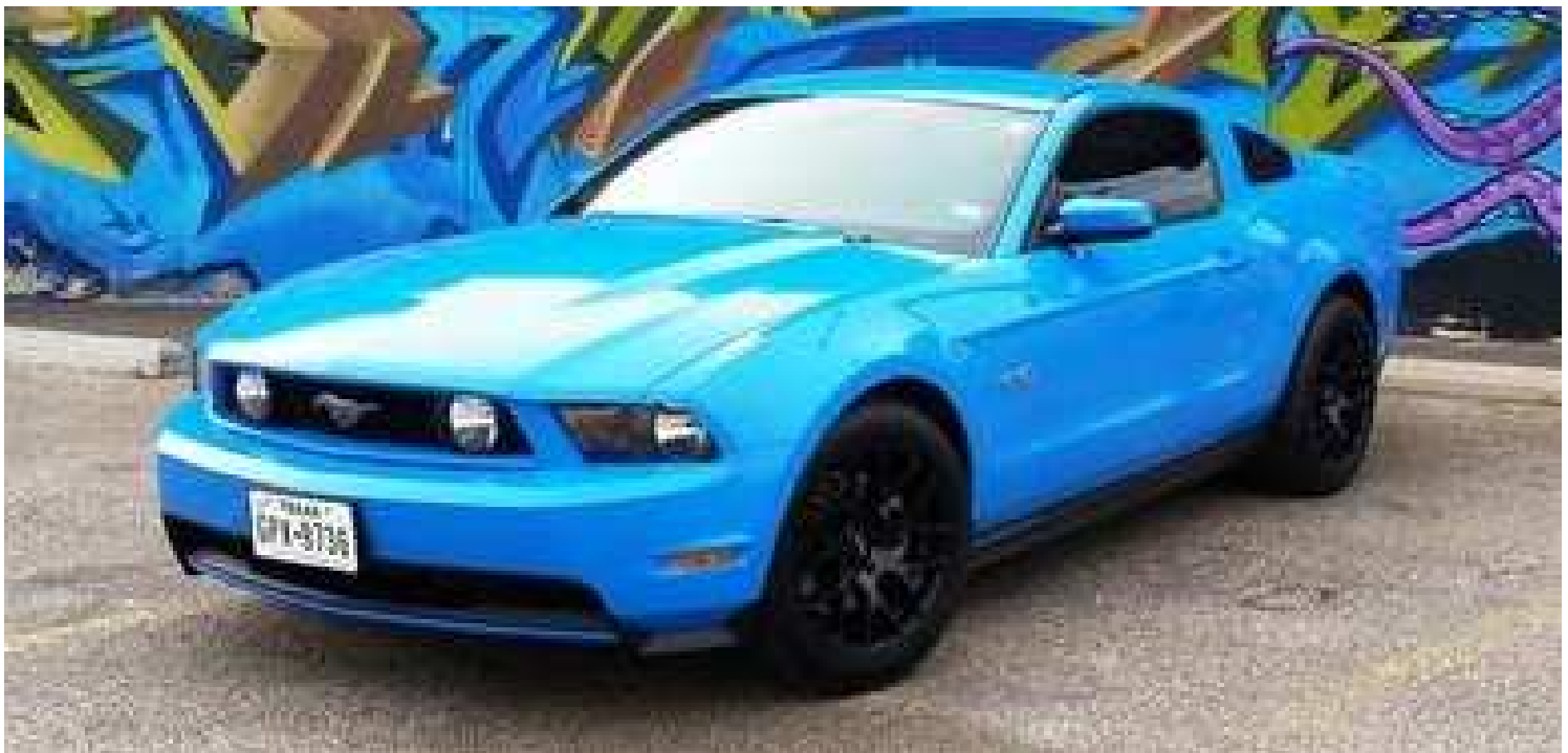
Dwight Herrin - 2012 Coupe

Would you like to see your car here? Then send picture and information about your Mustang to LubbockMustangClub@gmail.com or mail the info to LMC, P.O. Box 65399, Lubbock TX 79464