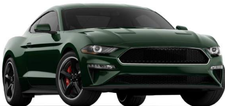
2019 Mustang BULLITT

Membership dues are $20.00 for new members and $25.00 per year thereafter, due on January 1 st .