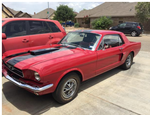
Camryn Oden | 1964 1/2 Coupe

Would you like to see your car here? Then send picture and information about your Mustang to LubbockMustangClub@gmail.com or mail the info to LMC, P.O. Box 65399, Lubbock TX 79464