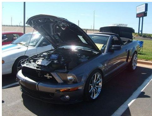
Glen & Velda Phipps | 2007 Shelby GT500 Super Snake

Would you like to see your car here? Then send picture and information about your Mustang to LubbockMustangClub@gmail.com or mail the info to LMC, P.O. Box 65399, Lubbock TX 79464